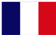
Le Goldwing Club De Norvège

Wishes you welcome to the Norwegian international Treffen '08 Hvalsmoen, Hønefoss