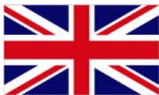
Goldwing Club Norway

Wishes you welcome to the Norwegian international Treffen '08 Hvalsmoen, Hønefoss