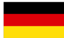
Goldwing Club Norway

Vous souhate la bienvenue aux Recontres Norvègiennes Internationales '08 Hvalsmoen, Hønefoss