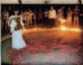
Nestinar - ancient fire ritual