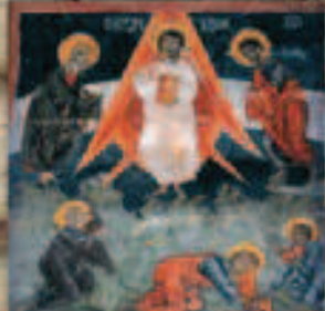
Fresco of Jesus Christ in a rocket, 16 c.