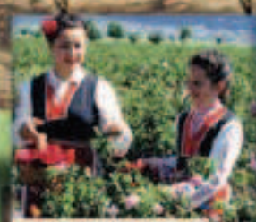
Bulgarian rose pickers