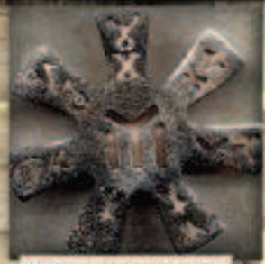
Medieval bulgarian sign