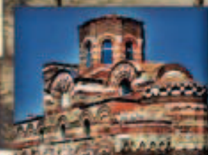
Temple of Sozopol